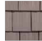
Weathered Blend 201