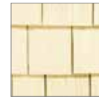
Sunny Maize 22