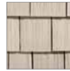
Warm Sandalwood 17