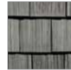
Canyon Blend 208