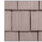
Adobe Clay 60