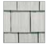
Harbor Stone 44