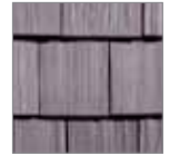
Charcoal Grey 84